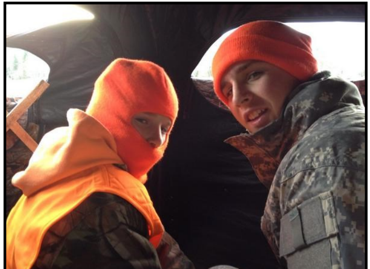
This picture of these two youth hunters showing off their orange on youth weekend was sent in by Amy Shopland.

If you or someone you know deserves to be in next month's newsletter, submit the photo and a short story to Nicole at Nicole.Corrao@state.vt.us